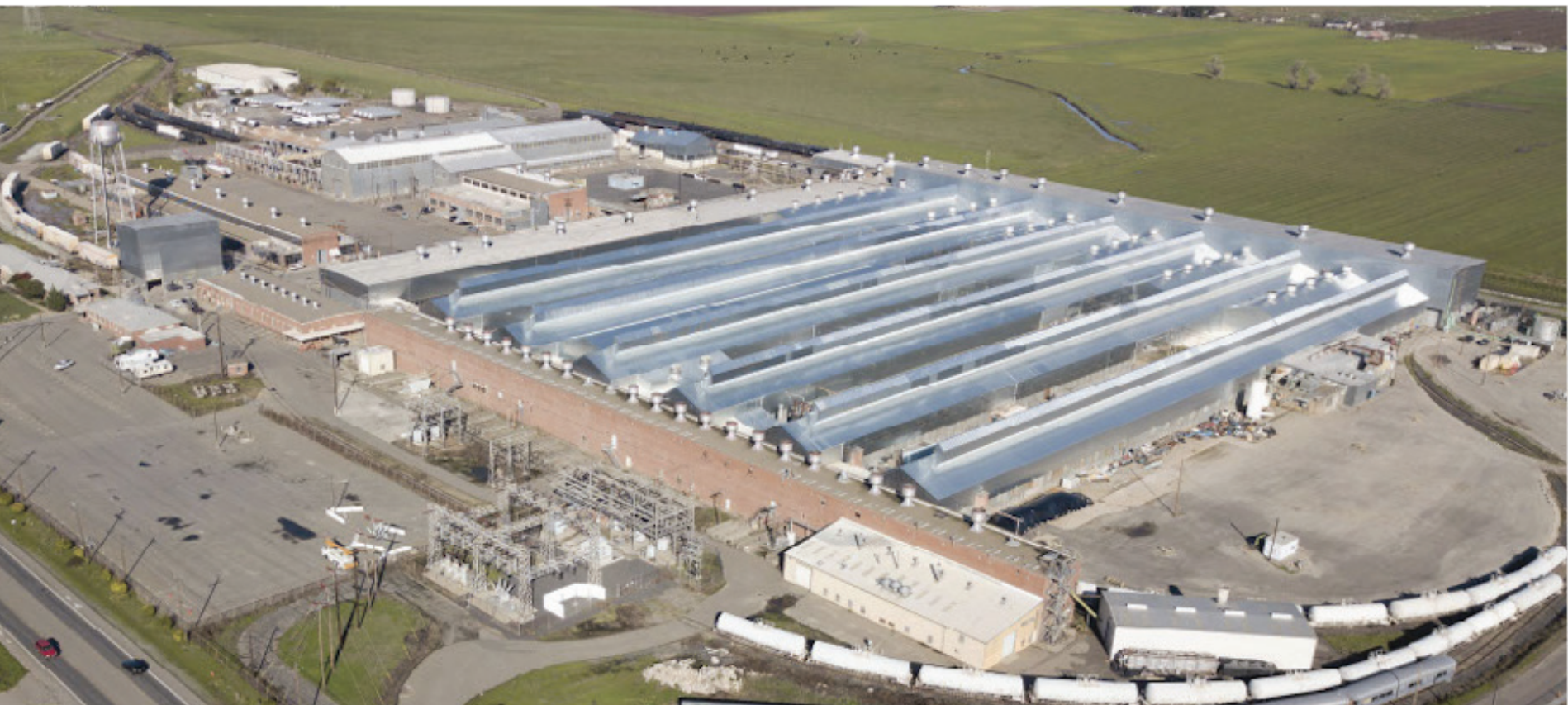
RIVERBANK ARMY AMMUNITION PLANT Riverbank, California